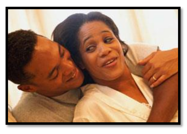
Most couples enjoy sex more!