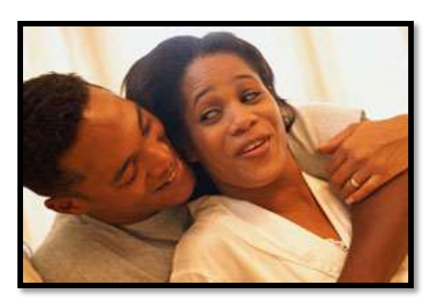
Most couples enjoy sex more!