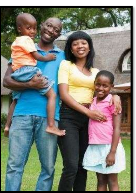
When your family is complete