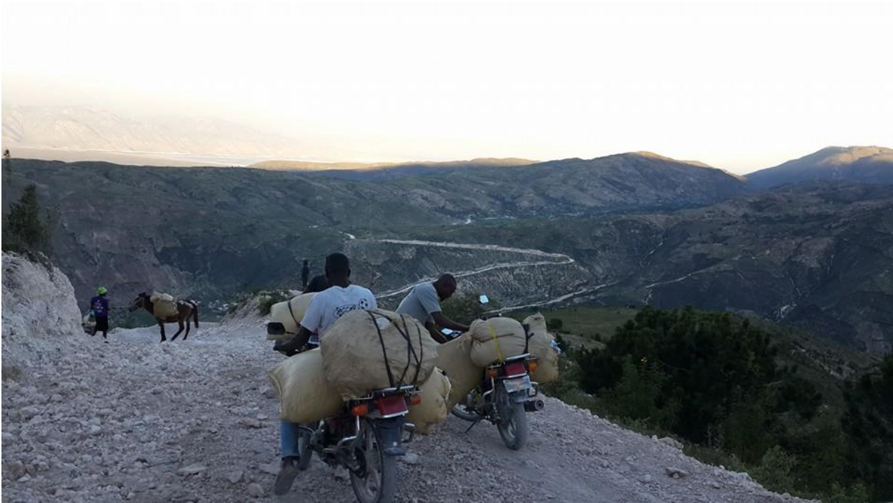
The way the people used some road they create with their hands