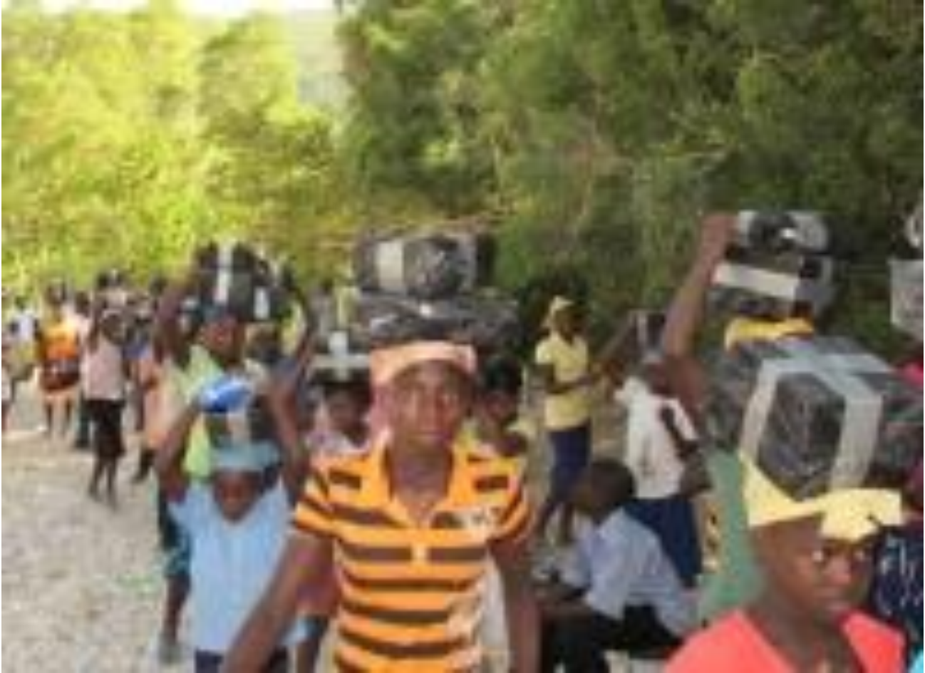
The children from Faith in God school come to meet me where the car can happen to bring their materials school we will share to them in The mountains