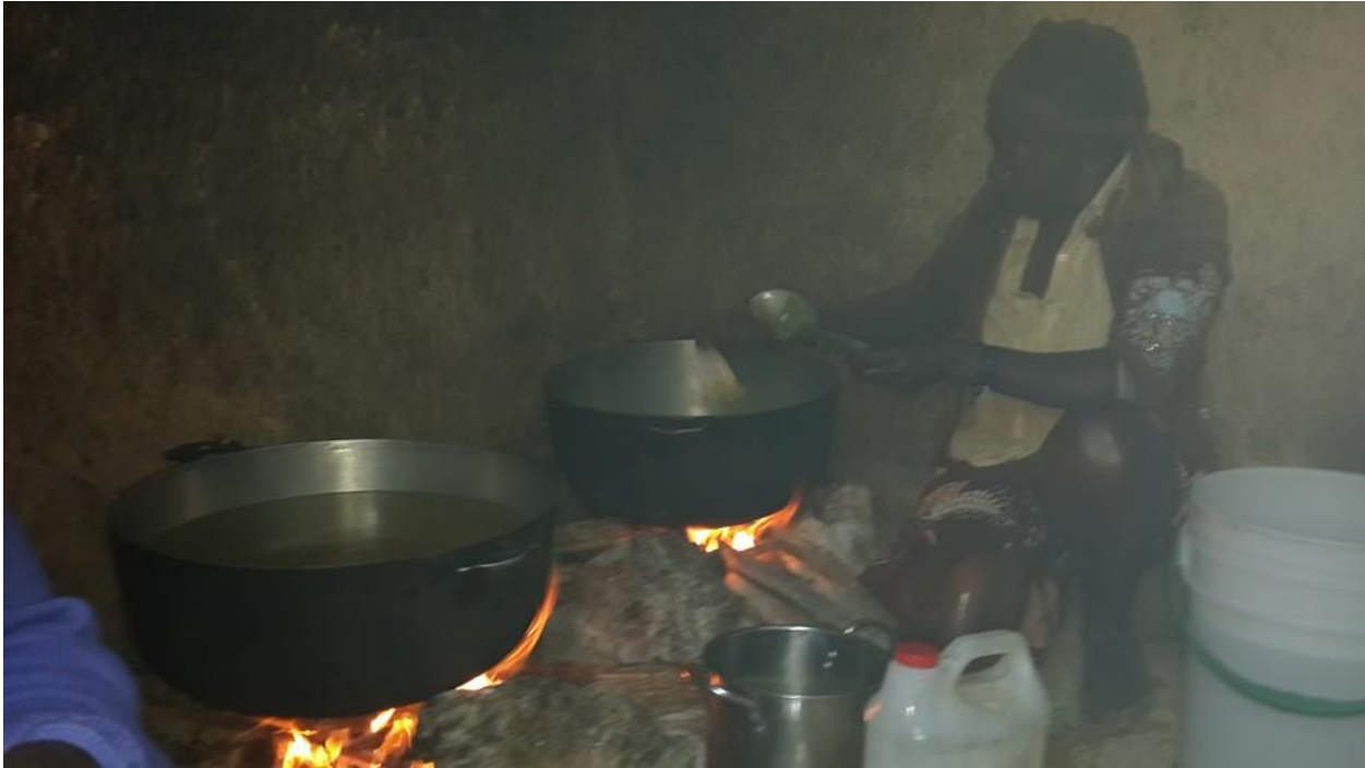
The way the people cook in My village