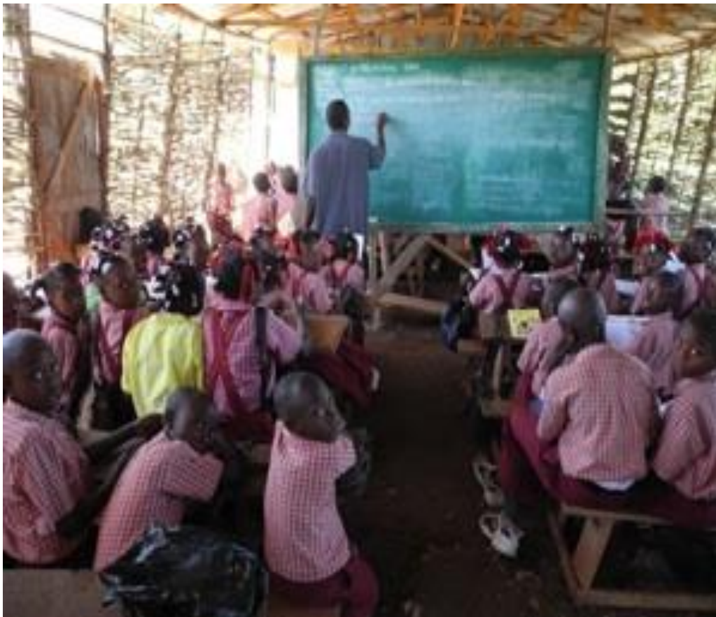
One class is working at Faith in God school in Pays pourr