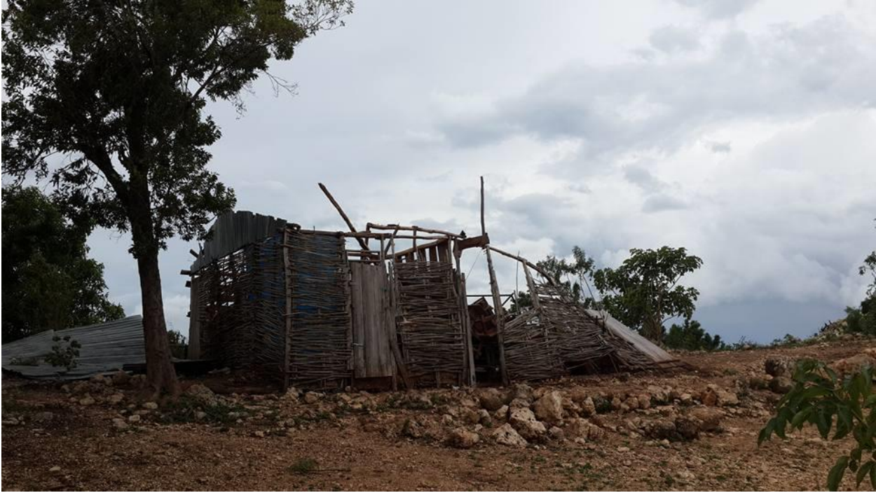
Faith in God School Destroyed after Hurricane Mathew October 2016 , in my community village's name Pelerin