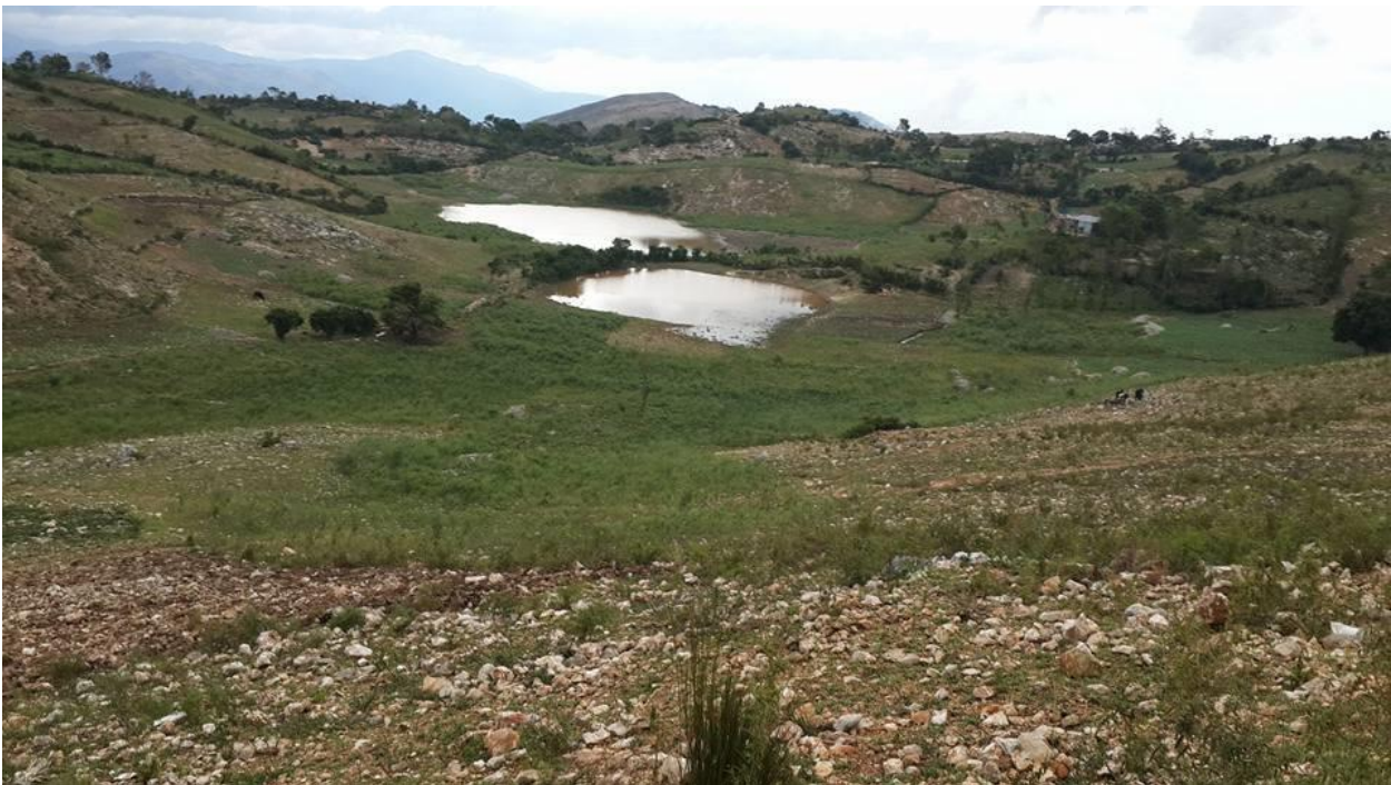
View of The one community in My village the name is Diobel